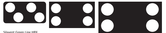
Silavent Green Line HRX. Supports kitchen and up to 7 wet rooms